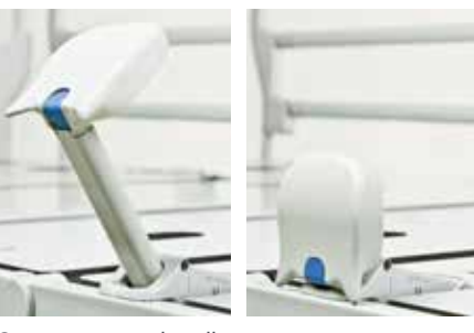
One-step egress handles